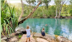
6. Stony Creek, Byfield (20 min drive from Cooberie Park)