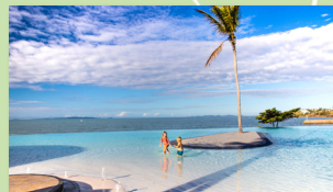
4. Yeppoon Lagoon & Keppel Kracken (35 min drive from Rockhampton)