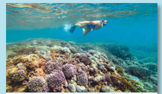
8. Pumpkin Island (30 min ferry transfer from Keppel Bay Marina)