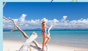
9. Great Keppel Island (30 min ferry transfer from Rosslyn Bay Harbour)