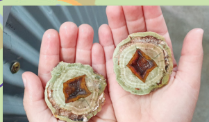
2. Mount Hay Tourist Park (20 min drive from Rockhampton Zoo)