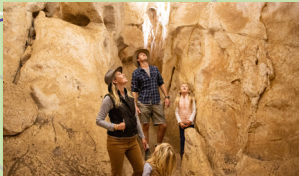
3. Capricorn Caves (25 min drive from Rockhampton)