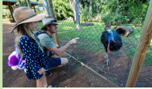
5. Cooberie Park Wildlife Sanctuary (15 min drive from Yeppoon Lagoon)