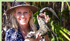
11. Koorana Crocodile Farm (15 min drive from Emu Park)