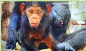
1. Rockhampton Zoo (5 min drive from Rockhampton CBD)