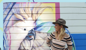
10. Emu Park (10 min drive from Rosslyn Bay)